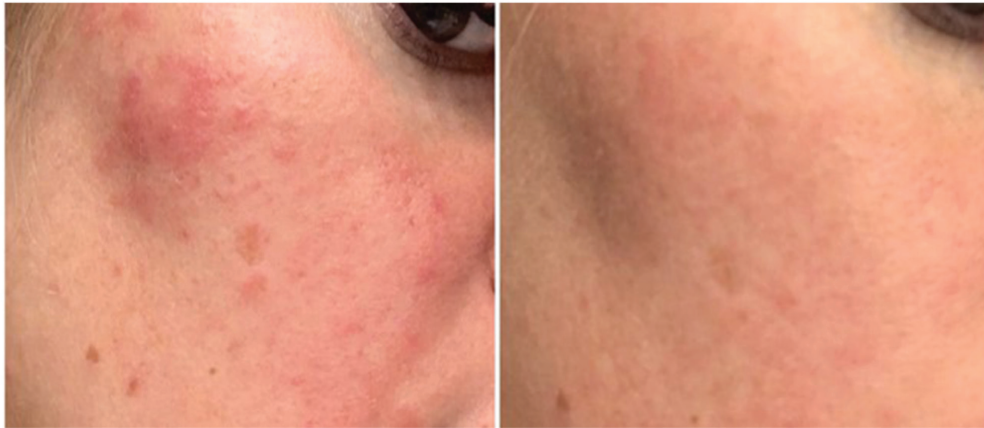
1 CO2LIFTPro TREATMENT 45 MINUTES AFTER APPLICATION