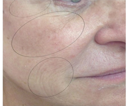
After 3rd treatment